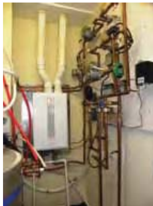
Tankless water heater